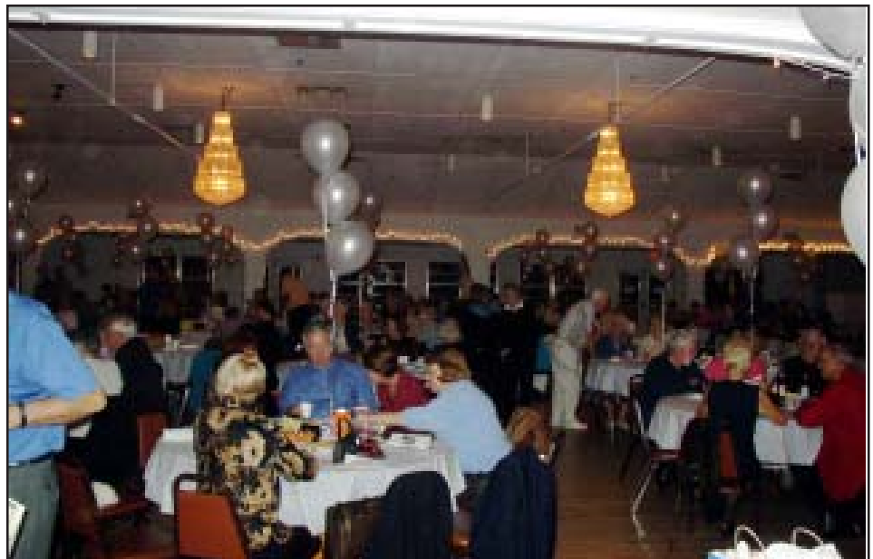
The Foundation’s first major public fundraiser, a dance entitled “Flashback in Time,” held in the historic Gulfport Casino Ballroom was a huge success in January 2007

We need YOU! Winston Churchill said, “We make a living by what we do, but we make a life by what we give”.