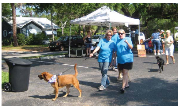
Pets and owners enjoyed browsing a variety of vendors at Wags & Whiskers May 21st